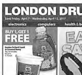
HOVER FOR FLYER