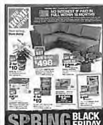
HOVER FOR FLYER