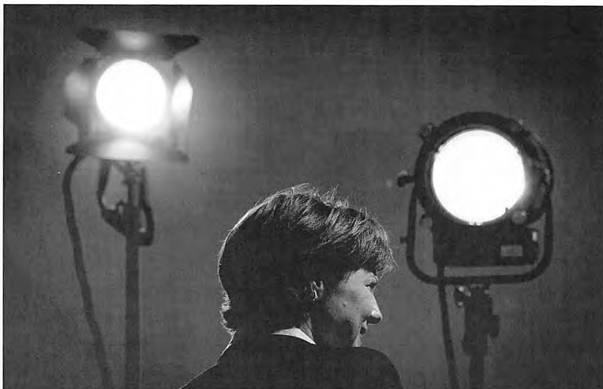
B.C. Premier Christy Clark.