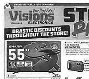
HOVER FOR FLYER