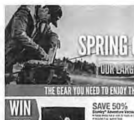
HOVER FOR FLYER